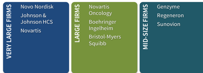
LEADING FIRMS IN MEDICAL SCIENCE LIAISON PERFORMANCE

Novo Nordisk, Johnson & Johnson HCS, and Novartis earn the highest overall MSL presence and quality scores across all managed markets panels. Novartis Oncology, Boehringer Ingelheim, and Bristol-Myers Squibb lead the large manufacturer segment, and Genzyme, Regeneron, and Sunovion lead among mid-size firms.